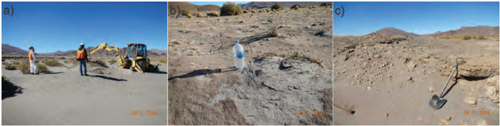
Figure 2 (a) Active waste-material sandy dunes; (b) Non-active waste-material sandy dunes; (c) In-situ old tailings.

that metals possibly leached from overlying TFSs and remobilized tailings might be retained in the waste material itself and/or the pre-mining sediments. However, further sampling and static/kinetic geochemical testing together with further data from hydro-chemical monitoring is necessary to assess chemical leaching from sediments to groundwater.